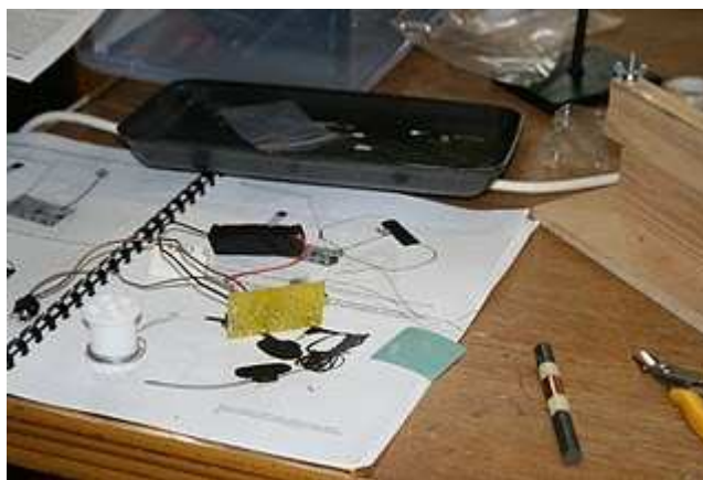
"Lucy's radio construction under way with coil neatly wound"