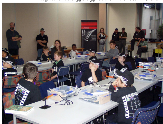
The start of the Buildathon

< http://sites.google.com/site/zl3buildathon/ >